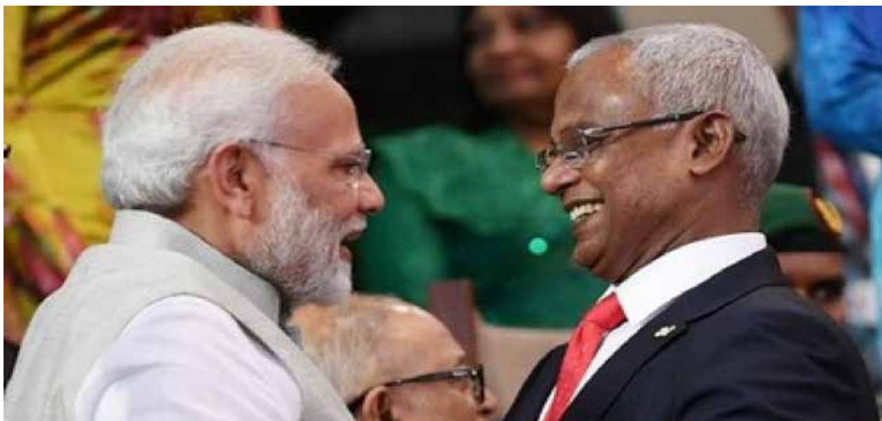
Prime Minister Narendra Modi with Maldives President Ibrahim Mohamed Solih during his visit to the island nation in June 2019.

On the economic front, since the new government came in, during the last 14 months we have had a 105% increase in tourist arrivals from India to the Maldives. Seven cities are connected from India to the Maldives. We are working on more. So, the more the connectivity between the two countries, the more tourists one can expect to visit.